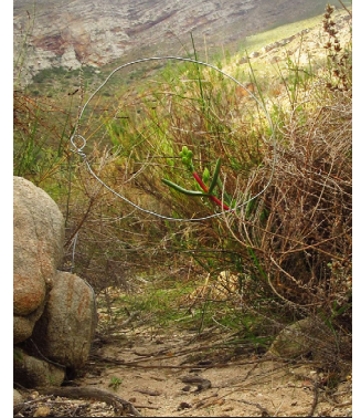
Snare in a path

Snares are placed along game trails or fence lines where there is a lot of animal activity. The nooses are carefully camouflaged or held in place with fine vegetation, and twigs or rocks are often placed to direct animal movement towards the snare. Some hunters even go as far as baiting their traps or placing them directly in front of animal dwellings (such as porcupine burrows). Stands of alien and disturbed natural vegetation tend to be hotspots for snaring activity.