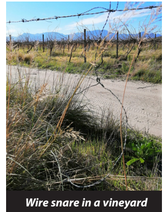
Wire snare in a vineyard