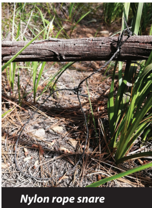
Nylon rope snare