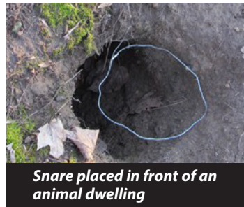
Snare placed in front of an animal dwelling