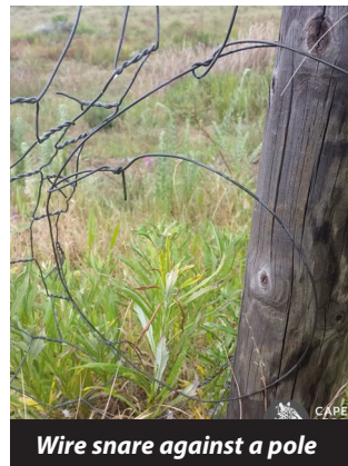
Wire snare against a pole