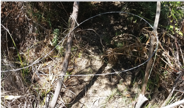
Snare with guide sticks

A snare trap is a simple piece of wire, cable, twine or nylon fashioned into a noose. The noose is then anchored to trees, fence posts and other vegetation, and positioned in such a way to capture animals either by the foot (placed parallel with the surface) or by the head or body (suspended vertically).